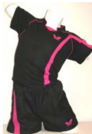
Global shirts Black/magenta 3xs-4 xl Price 24.90 Euro Global shorts Black/magenta 3xs - 4xl Price 16.90 Euro