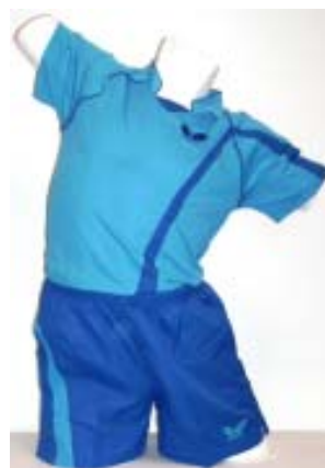
Global shirts Marine/blue 3xs-4 xl Price 24.90 Euro Global shorts Marine/blue 3xs - 4xl Price 16.90 Euro