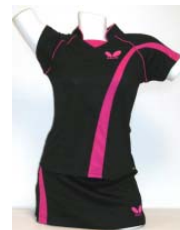
Global Skirt Black/magenta 3xs - 4 xl Price 24.90 Euro Global shorts Magenta/black 3xs - 4xl Price 16.90 Euro