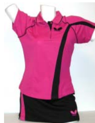
Global Shirt Lady Magenta/black Price 24.90 Euro Global shorts Magenta/black 3xs - 4xl Price 16.90 Euro