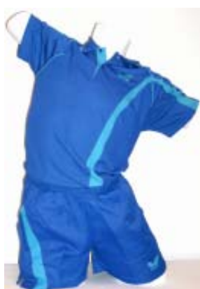
Global shirts Blue/marine 3xs-4 xl Price 24.90 Euro Global shorts Blue/marine 3xs - 4xl Price 16.90 Euro

Before the Olympic Games 2008 a new, world wide shirt and shorts series „global“ was designed. These were presented by some table tennis associations during the competitions. The result shows an attractive clothes collection which we now can bring on the market. It includes two shirts, one Lady Shirt, shorts and a skirt in different colour combinations. The striking dynamic design of the shirts is combined with the functional 100% polyester micro which is comfortable to wear and optically attractive. The men's shirts are available with two different collars, one with buttons, the other one with a straight collar (in black only). They are optimally combined with shorts in matching colours and a good fitting. The Lady Shirts are available in two colours with buttons and a waist cutting. The matching classical skirt is an ideal supplement.